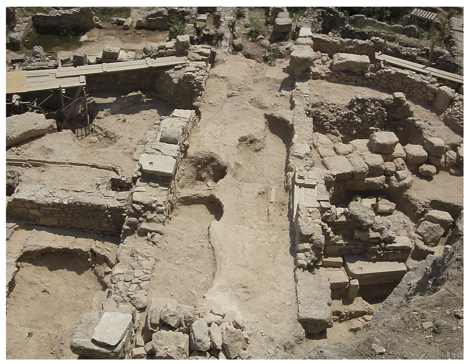
Fig. 2 - General View of north-south street