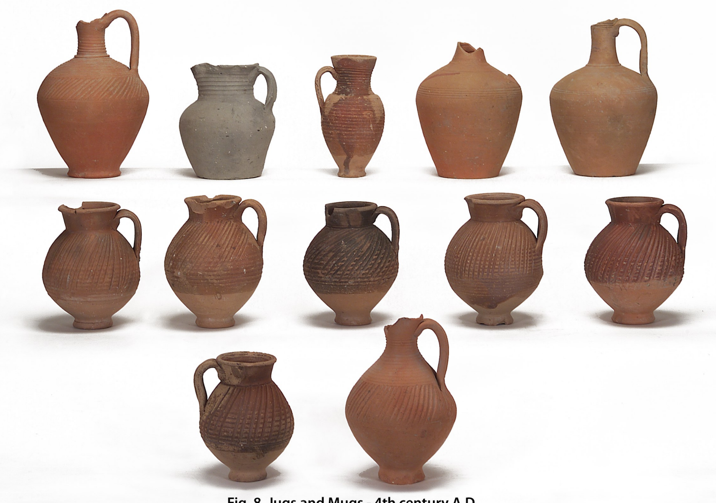
Fig. 8 Jugs and Mugs - 4th century A.D.