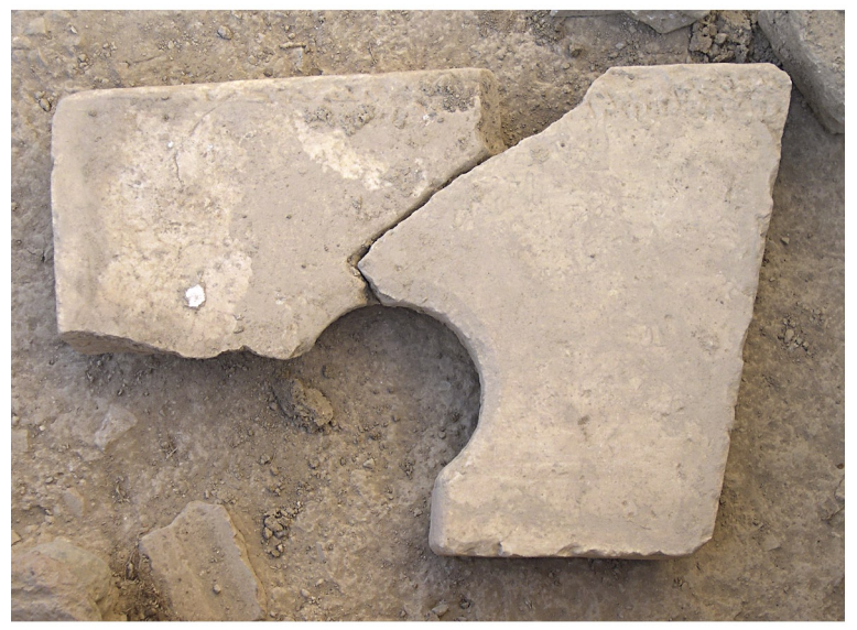
Fig. 3 - A seat block for a latrine