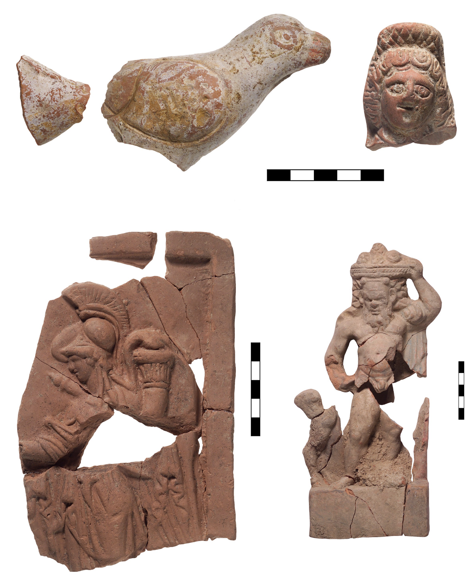
Figure 6. Terracotta Figurines