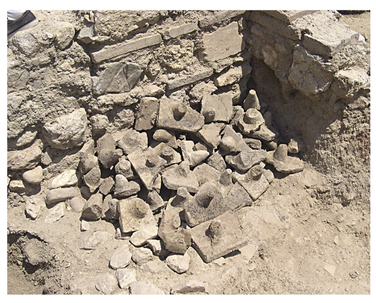
Fig. 4 tegulae mammatae